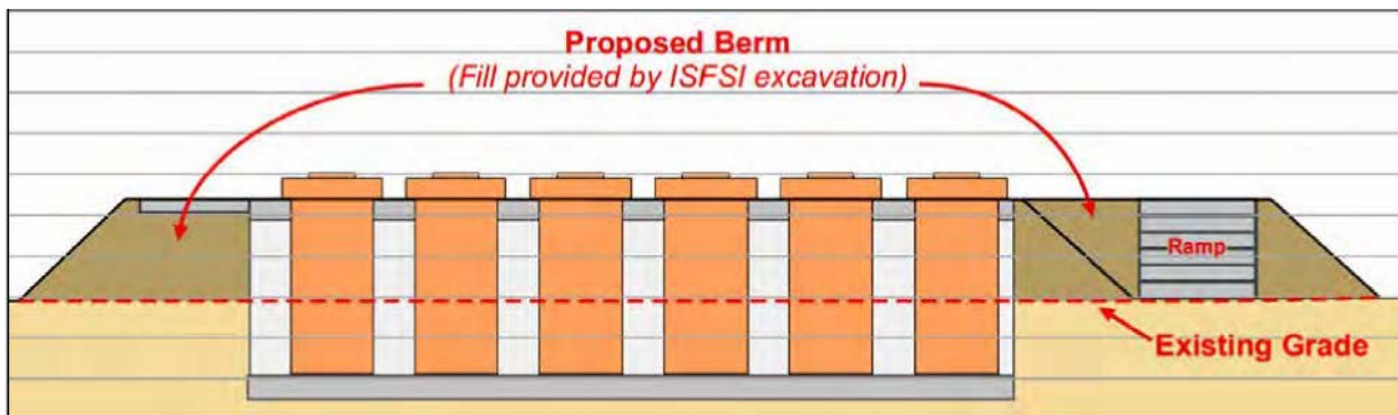
Figure 1. Cross section illustration of the concrete pads and storage modules. The space between the cylindrical storage modules is filled with a flowable grout material.